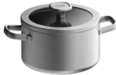
COVERED CASSEROLE 3950491 16,00 cm (6 2/4") 1,60 L (1.70 qt) 3950492 20,00 cm (8") 3,40 L (3.60 qt)