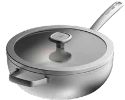
COVERED WOK 3950496 28,00 cm (11") 4,90 L (5.20 qt)