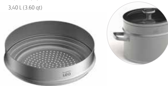
STEAMER INSERT 20/24 3950494 24,00 cm (9 2/4")