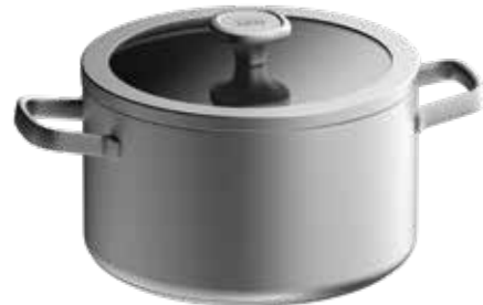
COVERED STOCKPOT 3950493 24,00 cm (9 2/4") 6,00 L (6.30 qt)