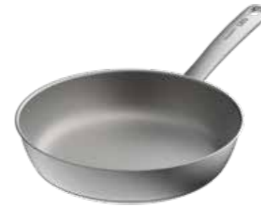
FRYING PAN 3950495 24,00 cm (9 2/4") 2,00 L (2.10 qt)