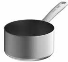
SAUCEPAN 3950490 16,00 cm (6 2/4") 1,60 L (1.70 qt)